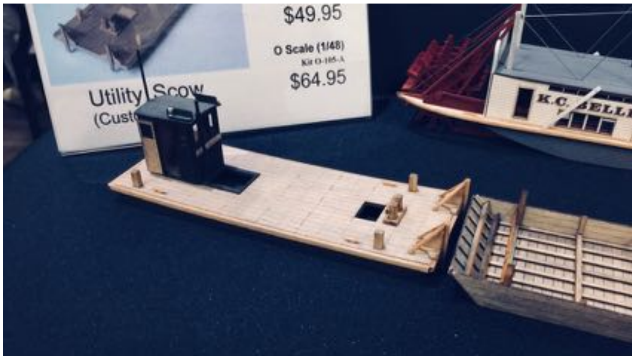
New products from Train Troll

The four vendors present this year were, Ages of Sail, BlueJacket, Sherline and Train Troll.