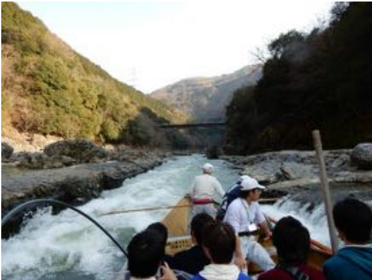
Modern Hozugawabune taking tourists downriver