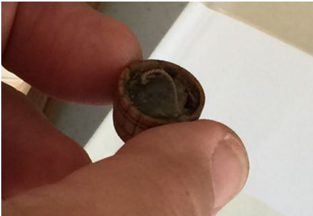
Paul used 5-minute epoxy to simulate the water in the buckets.