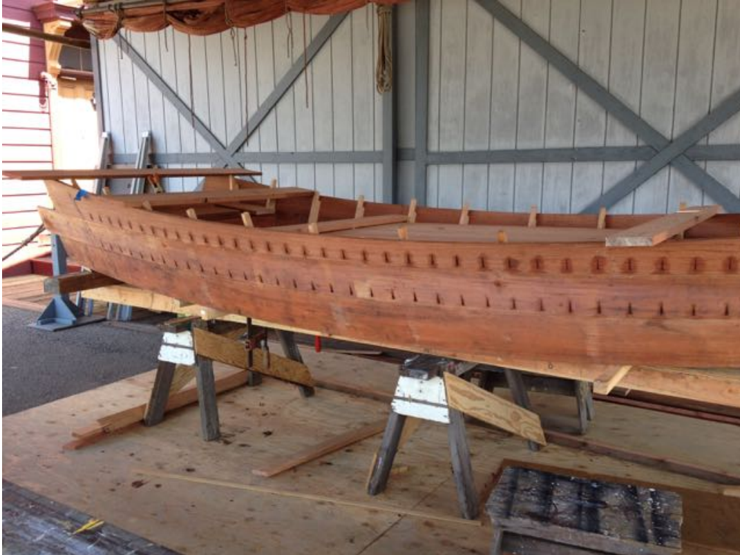
Reproduction of a Chinese boat that was used on San Francisco Bay being built in the small boat shop on Hyde Street Pier.

Clare also brought plans he obtained from boat builder Douglas Brooks, who used to work in the small boat shop just up the wharf from the Eureka. The plans are for a small traditional Japanese boat called a Bekabune (beck-ah-boo-nay). Clare mentioned that the boards that make up the hull are edge fastened and someone pointed out that there is a replica currently being built of a Chinese small boat that features edge fastened planking. While Chinese boat construction followed different approaches than the Japanese boats, there is a lot of similarity.